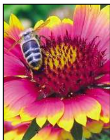
BEAUTY: Nature at best

Everything is explained and shown clearly and sim-