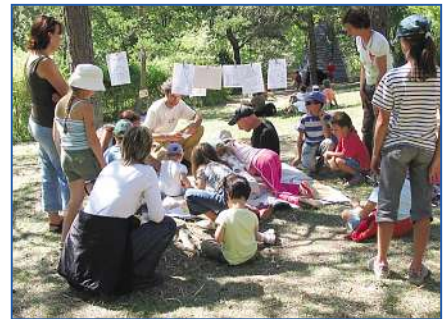
PLAY CAN BE LEARNING TOO: Nature workshops

WHILE parents are learning how to save energy or planting a vegetable garden, kids can find lots of educational and amusing activities to keep them occupied. From the age of six specialised staff take care of them, helping them discover the plant village, the universe of Mili the bee, the donkeys Charlotte and Myrtille, look for the mysterious Bêtacones or observe the unusual insect hotel.