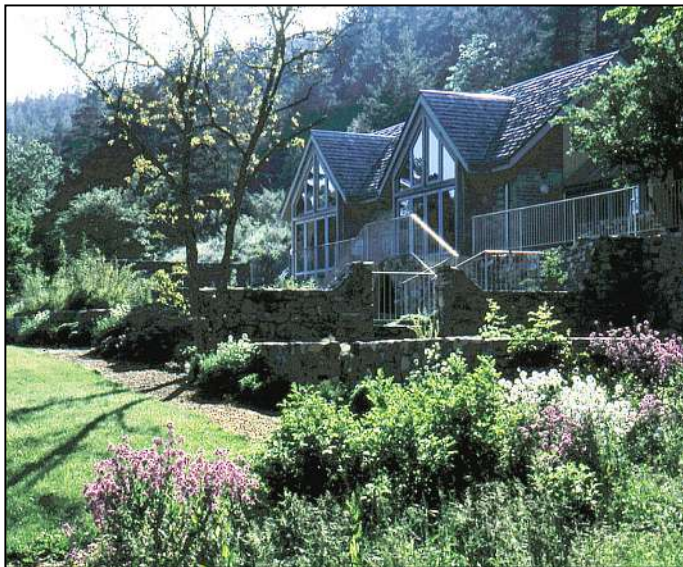
NATURAL: Centre is wealth of information about ways to help save the environment

ply to visitors. Children's educational books are also published by the company which has been campaigning for nature conservation for the last 25 years.