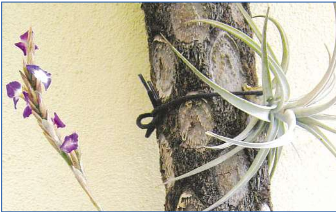
TILLANDSIA DURATII: It is easy to grow and only needs an occasional watering

This plant is growing on a tree fern in the shade of a Parasol Pine and has exceptionally-sized flowers compared to its volume. As nour-